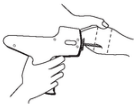
Fig. 2 - Rear View of the Bovine Ear Showing the Site for Insertion of the Implanter Needle.

of the cartilage ring farthest from the head. The location of insertion of the needle is a point toward the tip of the ear and at least a needle length away from the intended deposition site. Care should be taken to avoid injuring the major blood vessels or cartilage of the ear.